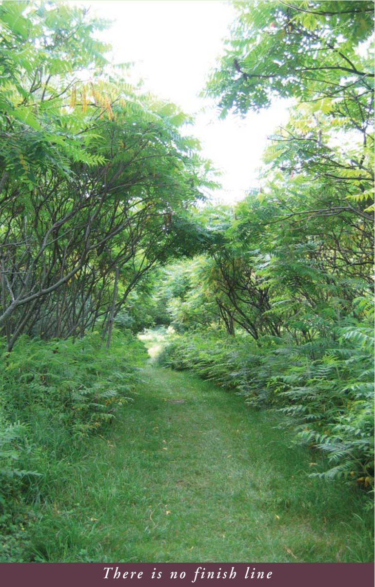
There is no finish line

Our goal is to build the first of the two bridges by July 2007 and have the second in place in time for our Old Boys and Old Girls Reunion in 2008.