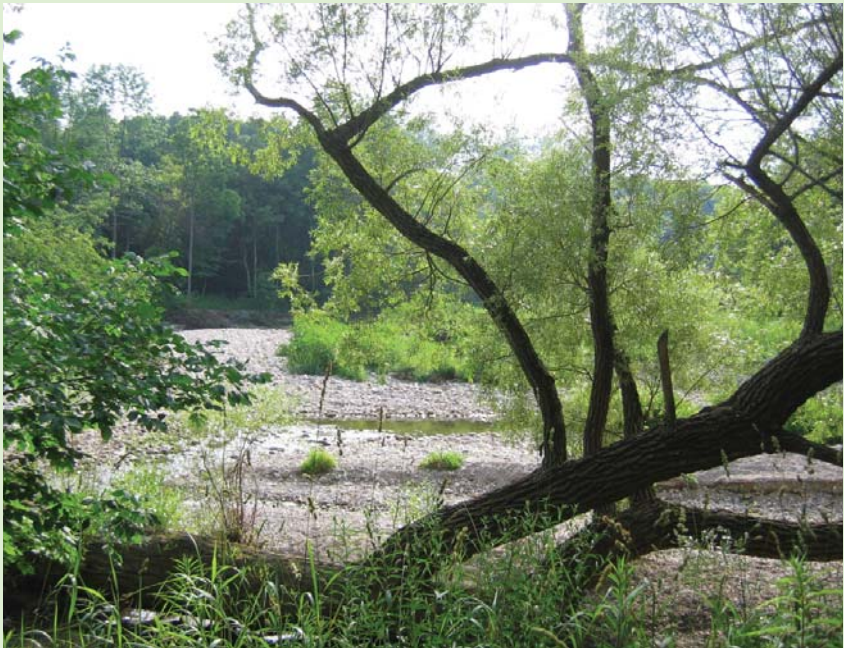
Fallen tree and water

All of the above, plus your family or business name noted in our trails brochure for five years, plus a framed recognition certificate.