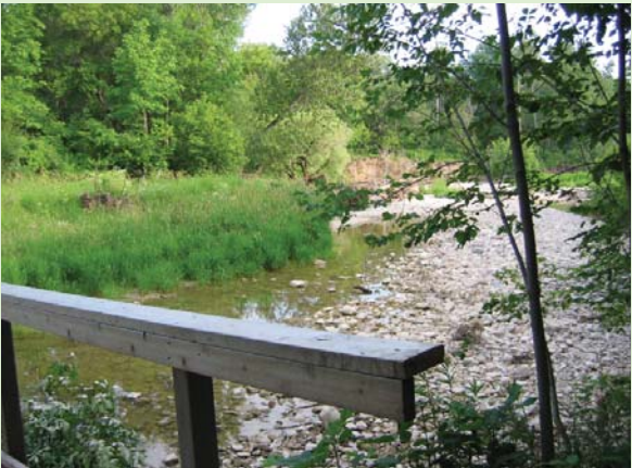
Bridge over water

On behalf of the Kincardine Trails Association we thank you for considering this fundraising request.